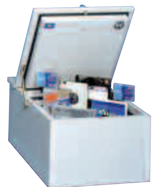
Data protection Insert DPI 08